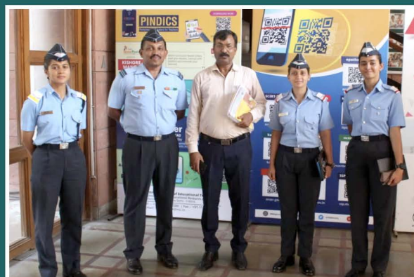
Visit of Air Force Academy Cadets & Officer to NCERT for Study Tour, 13 September, 2019

CIET-NCERT has been regularly facilitating enhancement of knowledge of students, teachers and teacher educators through various means. One such way is to orient them through visits done to the institution. During these visits they are introduced to the various initiatives of the institution and the manner in which audio-video and multimedia productions are done. The detail of visits done during this quarter of the year has been given below: