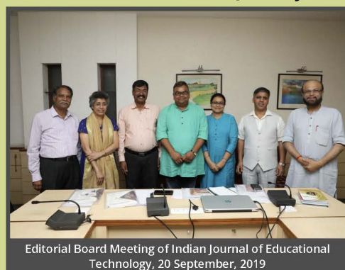
Editorial Board Meeting of Indian Journal of Educational Technology, 20 September, 2019

Under Resource-cum-Activity Centre in ET/ICT for School and Teacher Education, 04 Assistant Secretaries (IAS officers of 2017 batch) visited NCERT and CIET on 24 July 2019 in order to