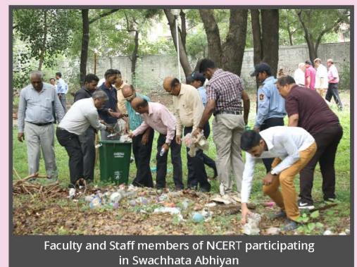
Faculty and Staff members of NCERT participating in Swachhata Abhiyan