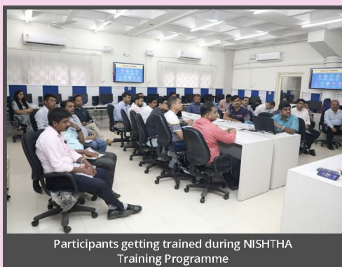
Participants getting trained during NISHTHA Training Programme