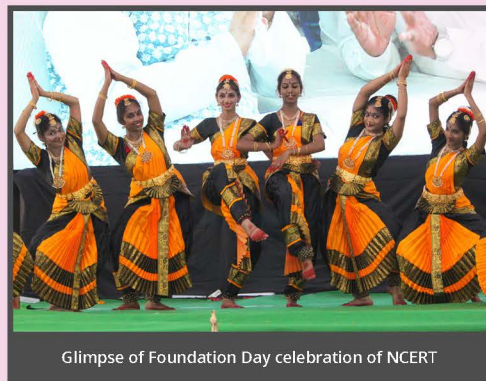
Glimpse of Foundation Day celebration of NCERT

Swachhata Pledge was taken by the Director with faculty members and other staff members of NCERT on 16 September, 2019.