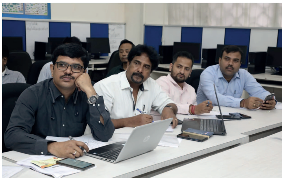
인도 NCERT 교육 전문가 초청 워크숍 Workshop for Indian Educators of NCERT

날짜 | 2019. 9. 16. ~ 9. 20. 주최 | 한국학중앙연구원 국제교류처 한국바로알리기사업실