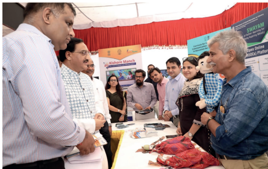
HRD Minister visiting and interacting at CIET's Stall on Foundation Day of NCERT