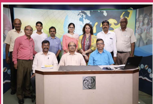
The live production group of SWAYAM Prabha after the live program of Director, NCERT on 05 September, 2019

Under the Development and dissemination of ETV Programmes through DTH - TV Network for Schools , responses of 29 institutions, those who have responded to the letter sent for the status of the DTH network are being analysed for further action.