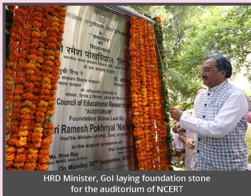
HRD Minister, GoI laying foundation stone for the auditorium of NCERT

Foundation Day of NCERT was celebrated on 02 September, 2019 in the premise of NCERT. Stalls of various departments and subsets of NCERT were put up and a cultural programme was organised. The HRD Minister, GoI Dr. Ramesh Pokhriyal 'Nishank' graced the occasion and laid the foundation stone for the Auditorium of NCERT.