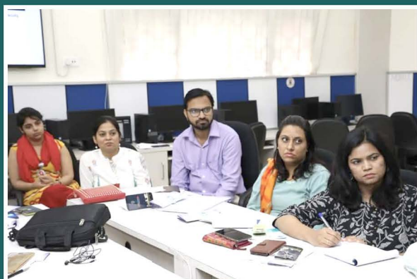
NCERT faculty members visited CIET as part of the Orientation-cum-Refresher Course, 26-27 September 2019.