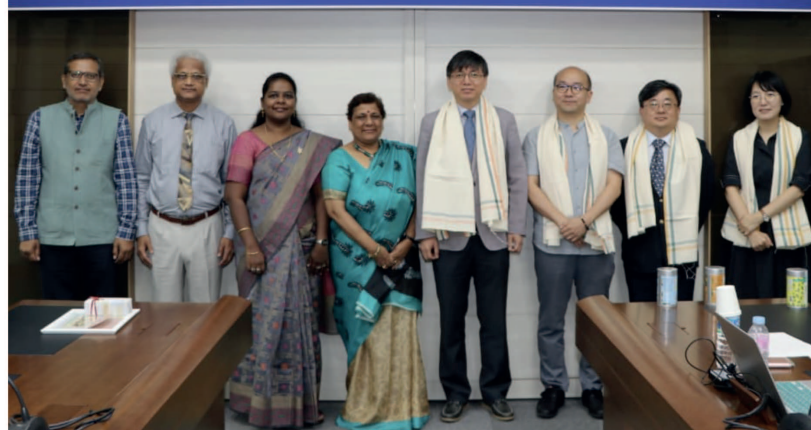
Faculty members of NCERT participated in a workshop at Korean Education Research and Information Service (KERIS), Korea

날짜 | 2019. 9. 16. ~ 9. 20. 주최 | 한국학중앙연구원 국제교류처 한국바로알리기사업실